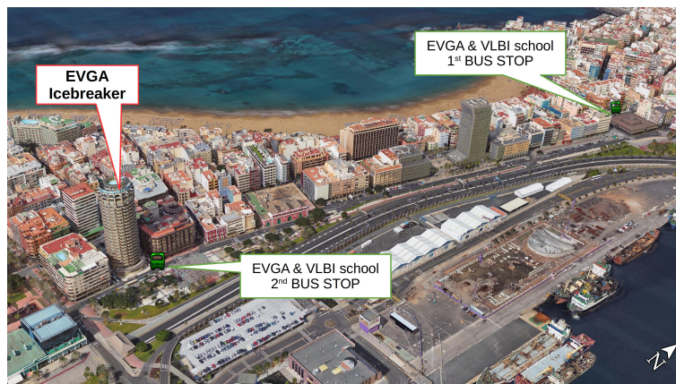
EVGA 2019 icebreaker and organised bus transfer meeting points